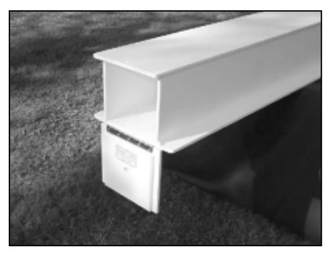
End Opening Storage Box